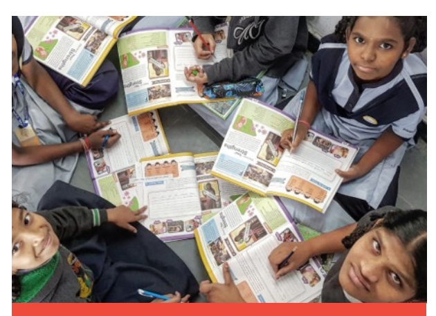
Her Voice Disha and Parichay Camp for girls from a government school in Telangana

PwCIF is supporting a project in Hyderabad to create a learning atmosphere that encourages young women to think critically, speak in English confidently, be reflective and creative, and find ways to apply the classroom knowledge to real-life situations and challenges. The intervention is empowering over 500 girls across five low-cost private schools by providing them with critical knowledge about health, safety and self-awareness, and building their communications skills for negotiation and self-advocacy.