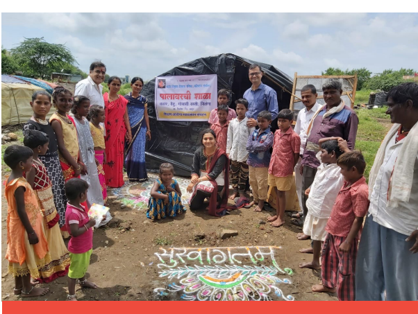
Support to makeshift schools in Osmanabad

Nomadic tribes are one of the most vulnerable groups in the country and lack access to basic healthcare, livelihood opportunities and education. PwCIF is supporting makeshift schools for nomadic communities in Latur, Solapur, Osmanabad, Pune and Kalyan in Maharashtra to encourage doorstep education and reduce the barriers that children from these communities face. We also supported the livelihoods of schoolteachers from such communities during the pandemic to ensure their well-being and the children's continued access to education.