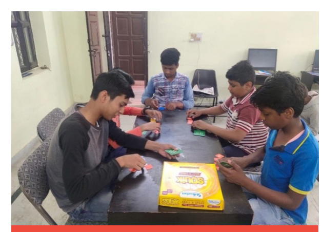
Library and resource centre for children and young adult beneficiaries

Good infrastructure facilitates better instruction, improves student outcomes and reduces dropout rates amongst the youth. PwCIF collaborated with its NGO partner on a development programme that has set up a library and resource centre for 523 young and adult beneficiaries. The READ Library is an engaging place for both kids and adults. The beneficiaries visiting the library are mainly children and young adults from the community who are aged between 12–25 years and studying in schools or colleges. They are enthusiastic about learning new concepts and participating in the activities and sessions planned by the centre staff involving videos, presentations on specific topics, reading newspapers and books, and speaking and reading English.