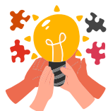
Diversity and inclusion