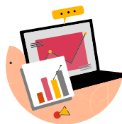
Account receivables and account payables