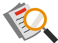
Applied research techniques

Our training competencies are extensive and therefore not all of them are outlined in this curriculum. Other areas of expertise we can deliver training with a tailored training module are: