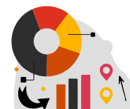
Financial statement analysis and interpretation