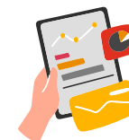
International Public Sector Accounting Standards (IPSAS)