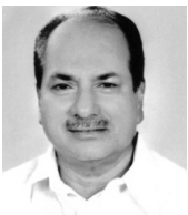
A.K Anthony Hon'ble Minister of Defence Government of India

Here is wishing the deliberations at the Conference all success.